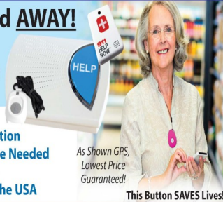
As Shown GPS, Lowest Price Guaranteed! This Button SAVES Lives!